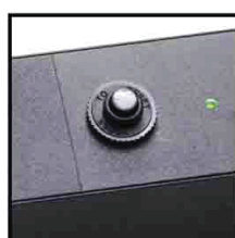
Overload Protection w/LED Indicator