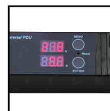
Volt - Amp Meter w/Alarm