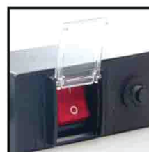
Lighting Switch w/Guard