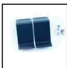
PDU Bracket Kit for Vertical Mount