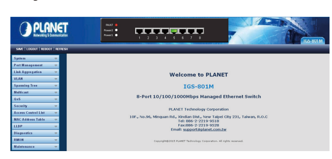
Figure 4-3 Web Main Screen of IGS Industrial Managed Switch