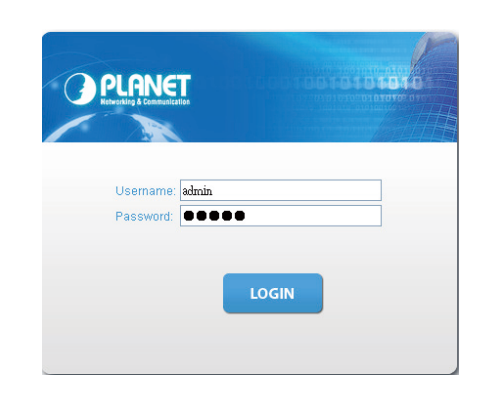
Figure 4-2 Login Screen

Default IP Address: 192.168.0.100 Default User Name: admin Default Password: admin